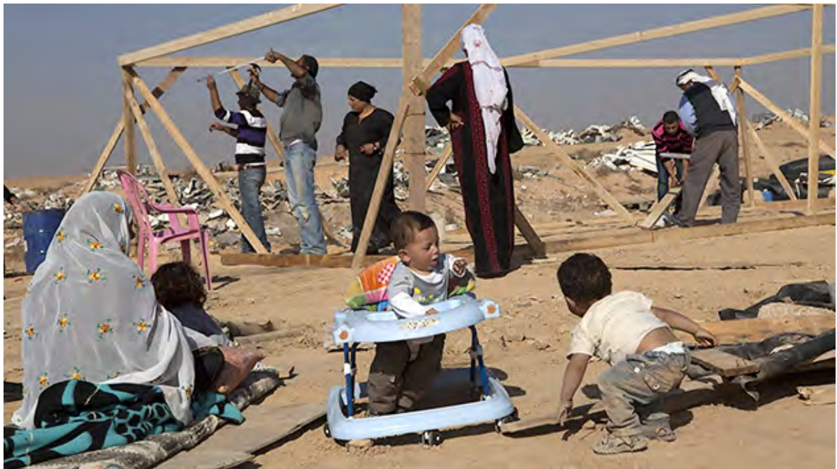
Figure 9: Rebuilding Homes in al-Arakib