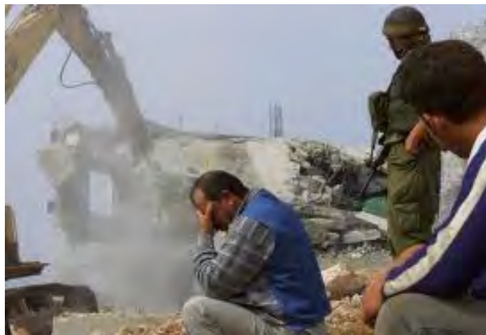
Figure 4: Destroying a Future

The Israeli Committee Against House Demolitions (ICAHD) estimates that at least 24,813 houses have been demolished in the West Bank, East Jerusalem and Gaza since 1967.