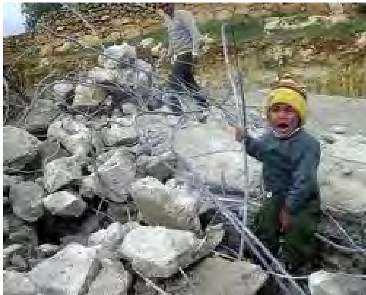
Figure 25: A child stands amidst the ruins of his home

There is clearly some tension because Israeli practice makes a nonsense of the ‘Quartet’ sponsored ‘Road Map to Peace’, brainchild of the US administration. In addition there is concern among the US military. Leading General David Petraeus warned that ‘American favouritism for Israel is fomenting anti-American sentiment’ which will translate into US military casualties in Iraq and Afghanistan.