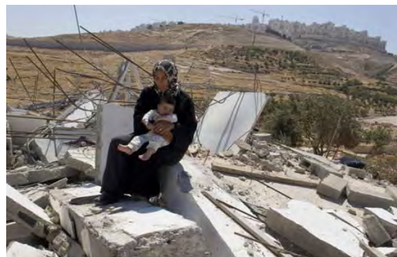
Figure 10: Demolished Home with Settlement in the background

A Palestinian wanting to obtain a building permit to build on his land in Area C must undergo a prolonged, complicated, and expensive procedure which generally results in denial of the application. In recent years 94% of all permit applications have been rejected. However, no such restriction exists for the Settlers. The Settlements contain thousands of houses built without permits; they are not demolished and are awarded permits post construction.