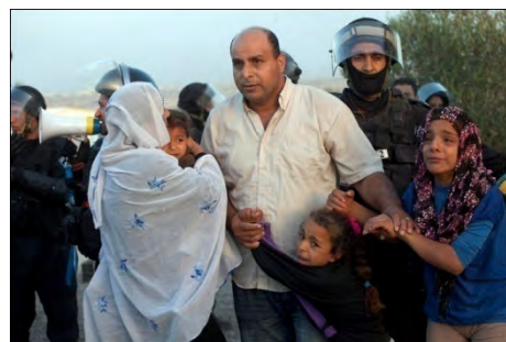
Figure 20: A family watch as their home is destroyed

Surveys carried out by the UN and by various NGOs reveal the devastating effect that home demolition has on the mental and physical health of those who have to endure it. The loss of the home frequently entails loss of livelihood as well. It can lead to break-up of the family, of the community, to pauperisation and to exile. Predictably, the shock is greatest for the most vulnerable – for children, the elderly and the disabled.