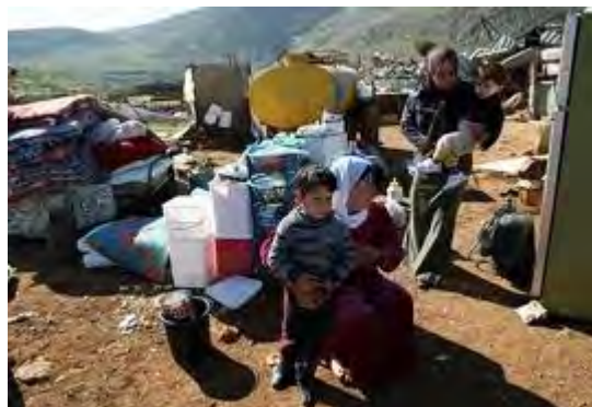
Figure 6: Homeless in the Jordan Valley

The Israeli Military/Civil Authority planned Area C to include Settlements (including the road network to connect them), closed 'military zones' and 'natural parks'. Palestinian construction in or near these areas was forbidden and any pre-existing Palestinian housing, be it village, farm, house or tent was demolished. Since Oslo, thousands of Palestinian residences have been pulled down and olive orchard and grazing land destroyed.