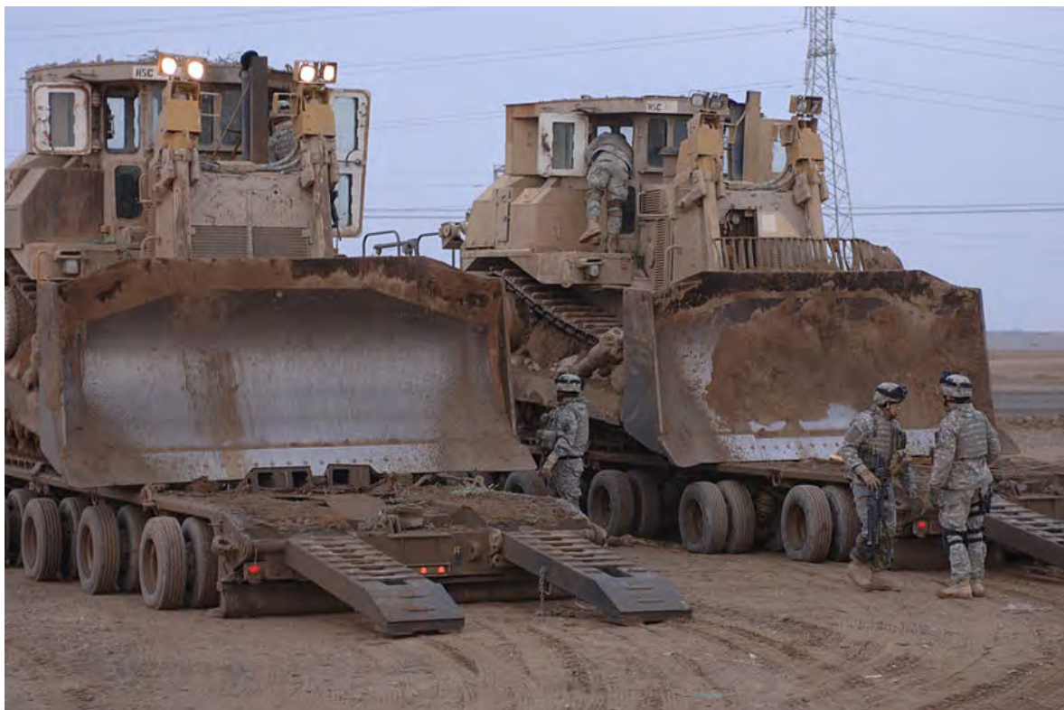
Figure 23: Caterpillar D9 Bulldozers