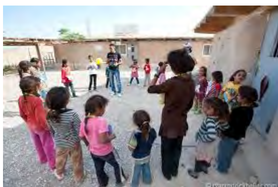
Figure 16: Khan al-Ahmar School

The Palestinian-Bedouin communities living in the hills to the east of Jerusalem are at an exceedingly growing risk of forced ethnic displacement. The Bedouin homes are currently located in an area called 'E-1', a 12km piece of land that Israel has earmarked for the expansion of illegal Israeli settlements like Ma'ale Adumim and Kfar Adumim, in order to link them up with occupied East Jerusalem. There are 20 Bedouin communities, comprising some 2,300 people, living in the E-1 area. These communities have all received demolition orders. Israel