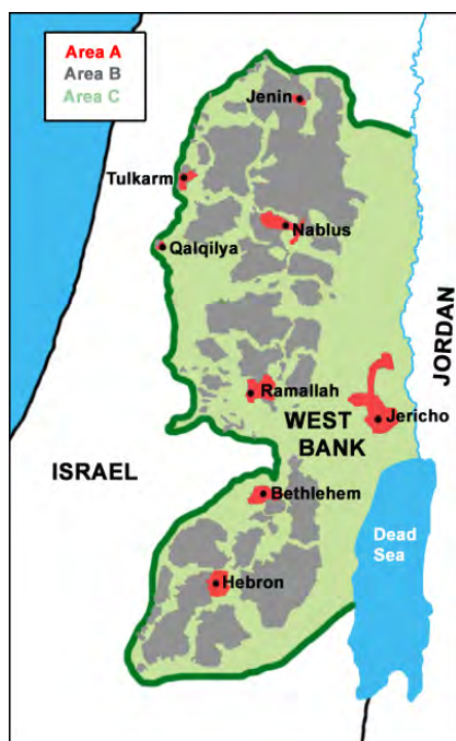
Figure 5: Areas A, B and C

Restriction on Palestinian development increased greatly following the 1995 'Oslo Accords'. Under this Agreement, the West Bank, excluding East Jerusalem, was divided into three Zones - Areas A, B and C, each with its own security and administrative arrangements and authorities, including land administration. A body, known as the 'Palestinian Authority' (PA), was also set up.