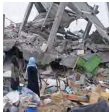
Figure 2: Home Demolition - Izbat Abd Rabo, Gaza

Home demolitions in Gaza have taken place principally for the first two reasons, namely, for military reasons and to terrorise and punish the population, while the third reason, demographic change, became the main driving force on the West Bank.