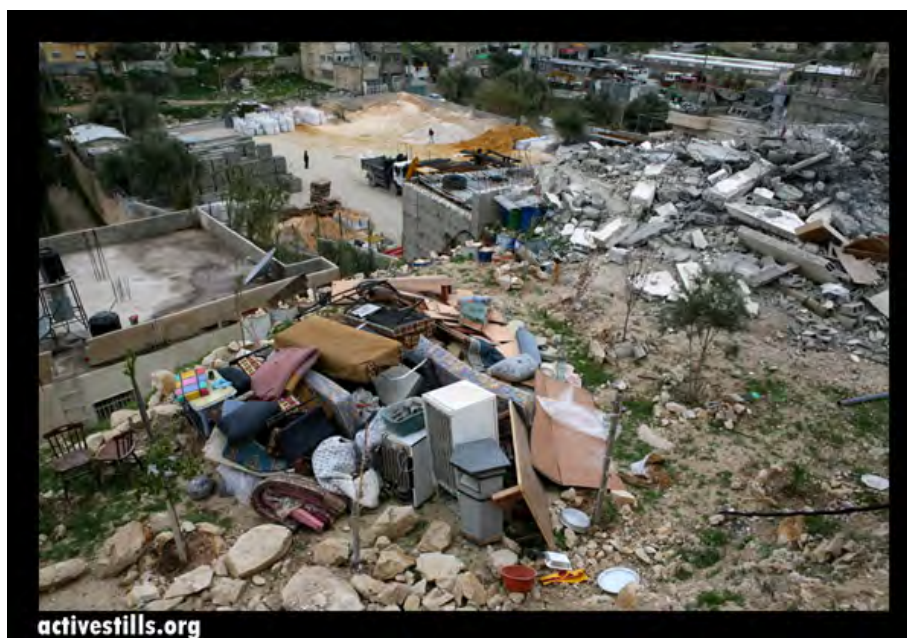
Figure 14: A Destroyed Home