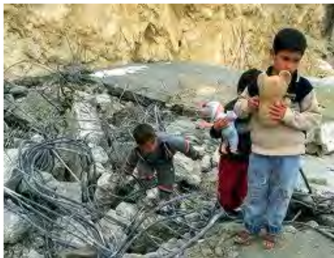
Figure 21: Children stand on the ruins of their home