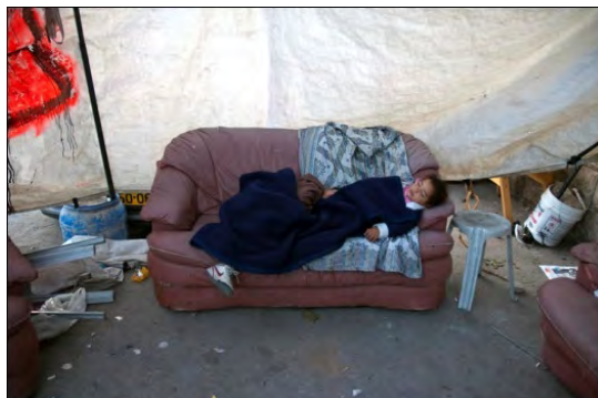
Figure 22: Child in 'Protest Tent'

People whose homes have been knocked down erect tents on the same site and refuse to move in protest at the injustice of their treatment.