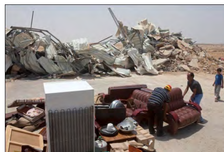
Figure 8: Destroyed Homes in al-Arakib

A striking example has been the 'unrecognised' village of al-Arakib in the southern Negev. Starting in the year 2000, Israeli planes annually sprayed poisonous chemicals over the wheatfields to destroy the crops. Then in July 2010, hundreds of Israeli police and bulldozers arrived and demolished the village completely, destroying homes, possessions, animal sheds, water tanks and electricity generators.