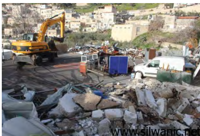
Figure 13: Destruction of the Wadi Hilweh Cultural Centre

Further demolitions are taking place to accommodate tourists visiting the 'theme park'. On the day in February 2012 that the Wadi Hilweh Cultural Centre, which included a playground and coffee shop, was bulldozed, Elad was given the go-ahead for the construction of a 'visitors' compound', to be part of the King David theme park. Further 'tourist development' is planned: car parks, accommodation etc. all to be built on the rubble and destroyed lives of Silwan.