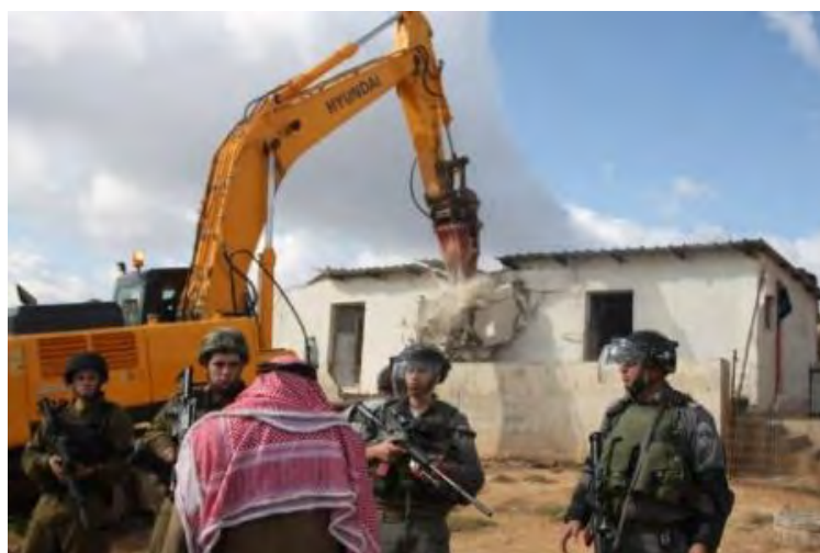
Figure 7: Forced Eviction

In a recent study the United Nations Office for the Co-ordination of Humanitarian Affairs (UN-OCHA) found that in 10 out of 13 Area C communities surveyed, families have moved away because "policies and practices implemented there (in Area C) make it difficult for residents to meet basic needs or maintain their presence on the land." The pressures causing Palestinians to leave Area C have led some analysts to conclude that Israel's grand strategy is 'transfer by stealth' of Palestinians to Areas A and B. There would be economic, political and strategic advantages to Israel in annexing Area C. Because it includes almost all of the Jordan Valley they would acquire fertile land rich in natural resources including water; the Palestinian community would be atomised in bantustan-type pockets surrounded by 'Israel' which would therefore have control over them; an independent Palestinian state would be impossible.