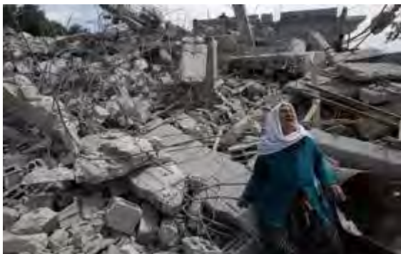
Figure 19: War Crime

When the Israelis are demolishing a home to punish a Palestinian accused of militancy, a curfew is usually imposed in the locality and tanks and armoured personnel carriers will accompany the unit carrying out the demolition. Frequently, the homes of those who have some connection to the accused – family members etc. - are also demolished. This is