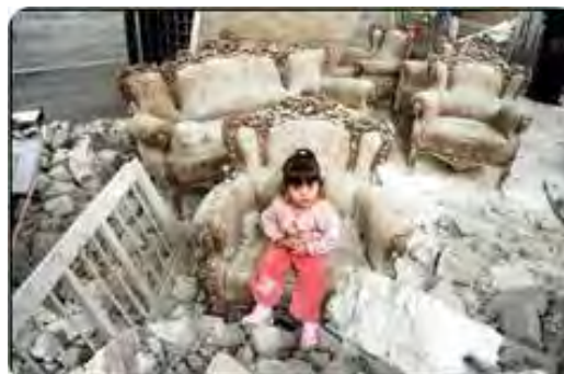
Figure 3: Baby in the Ruins of her Home

According to the Israeli NGO Ir Amim : [Elad] "....serves as a direct executive arm of the Government of Israel and enjoys comprehensive and deep backing by the Israeli Administration."