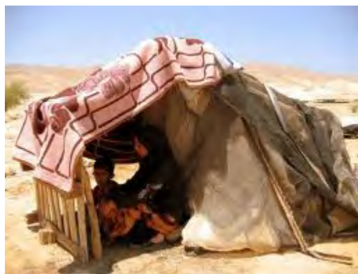
Figure 24: Makeshift Tent, Jordan Valley

Following the ever-increasing number of home demolitions, the UN Office for the Co-ordination of Humanitarian Affairs (OCHA) set up a Displacement Working Group in 2008 to monitor and publicise the extent of this Israeli practice. The Group has over a hundred members including UN agencies, international and local NGOs and donors.