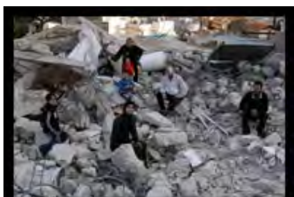
Figure 12: Silwan, East Jerusalem

Elad targeted Wadi Hilweh , a neighbourhood of the Palestinian village of Silwan which lies on the Old City's southern slopes, adjacent to the Ottoman wall and the Haram al-Sharif. The area is rich in history but the archeological investigations that took place in the past were carried out responsibly and with the co-operation of the villagers. These uncovered evidence of the many civilisations which have formed part of the story of Jerusalem. (For a full account see booklet The Story behind the Tourist Site produced by the Wadi Hilweh Information Centre www.silwanic.net )