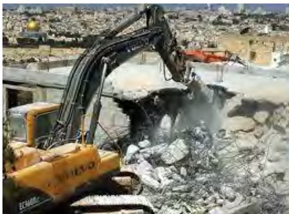
Figure 1: Home Demolition in East Jerusalem